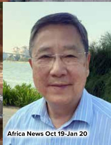
Africa News Oct 19-Jan 20