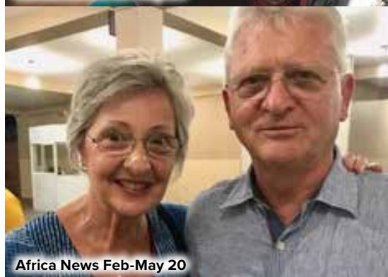
Africa News Feb-May 20