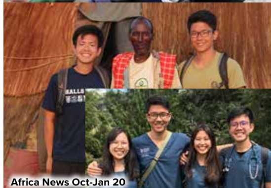
Africa News Oct-Jan 20