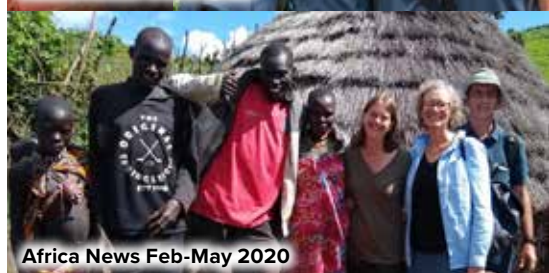
Africa News Feb-May 2020