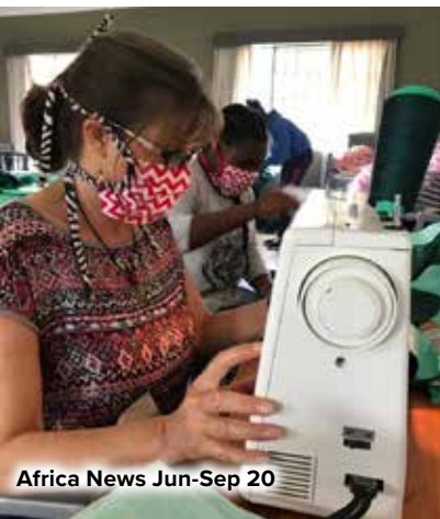
Africa News Jun-Sep 20