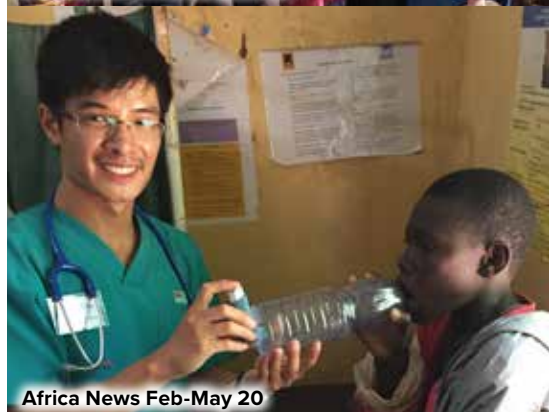
Africa News Feb-May 20