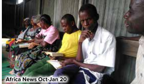
Africa News Oct-Jan 20

Why we do it: We are compelled by the Great Commission from Jesus in the Bible, to go, make disciples of all nations, teaching them all Christ taught his disciples. (Matthew 28:18-20; and John 3:16-18).