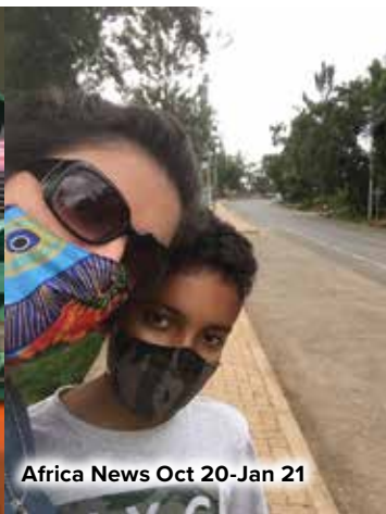
Africa News Oct 20-Jan 21