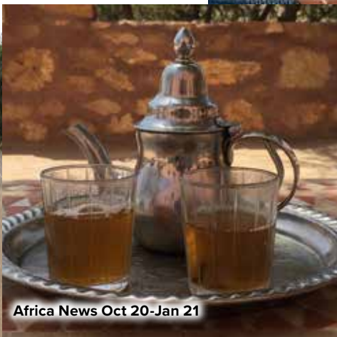
Africa News Oct 20-Jan 21