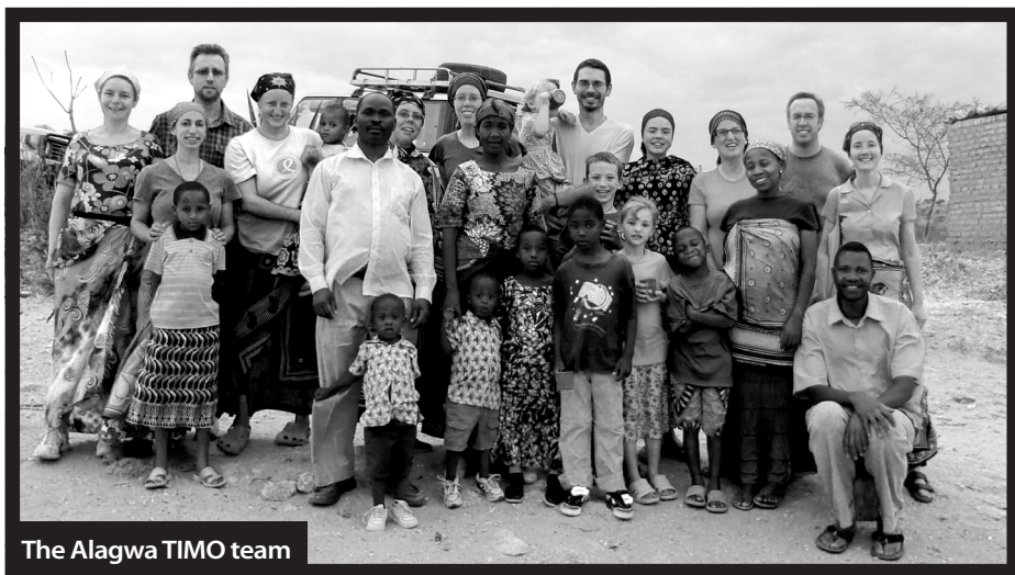
The Alagwa TIMO team