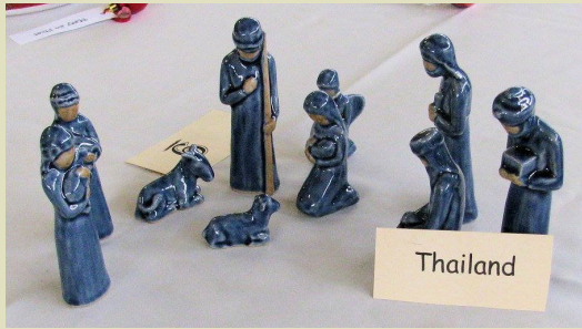
Theme : God’s Work Around the World