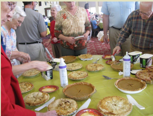
Pies, pies and more pies!!