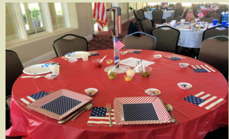
"Three Cheers for the Red, White and Blue"