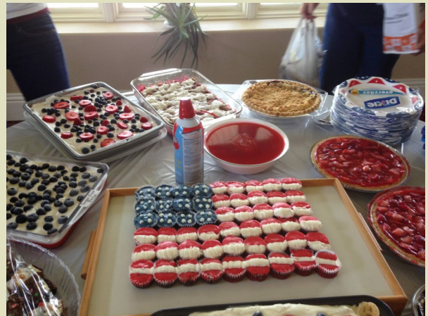
It's all about dessert!