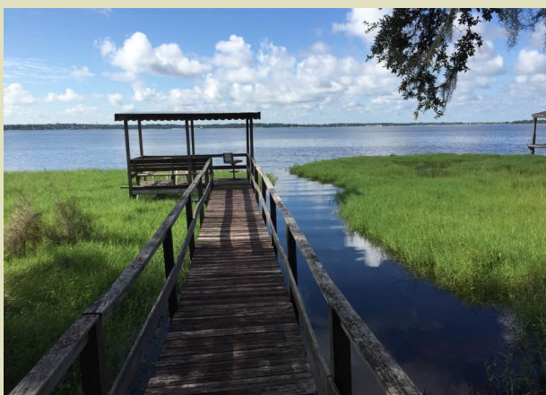
The beautiful view from the dock