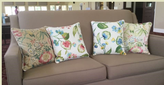
Just Some Fun