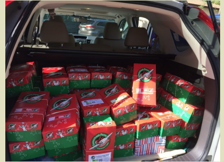
Operation Christmas Child