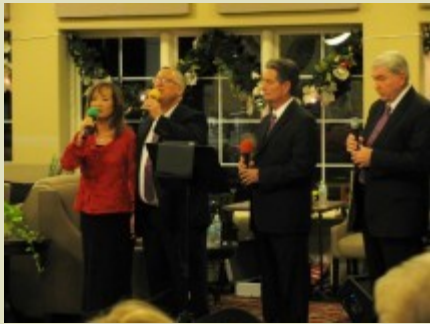
Three for Him