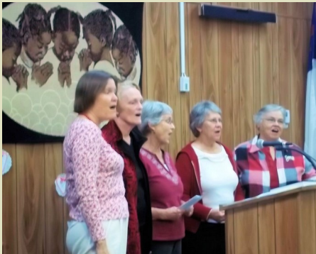
Ladies Singing Group