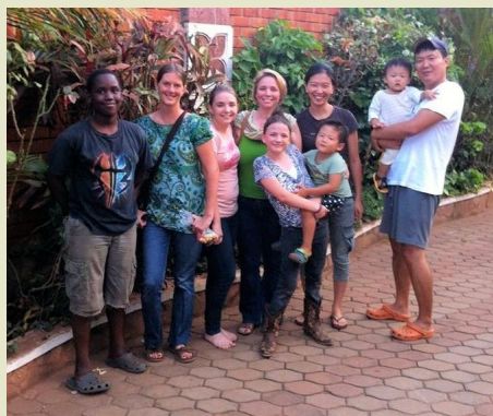
Former Media staff and e-plus student now in Uganda