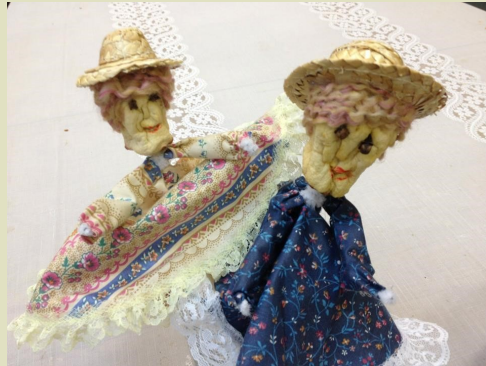
Dried Apple Faces