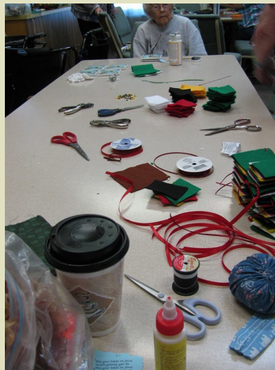
Wordless Books for Teen Missions