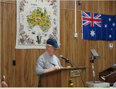
Darwin giving history