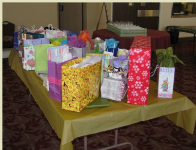
White elephant gifts