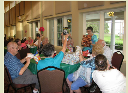
Opening the treasures