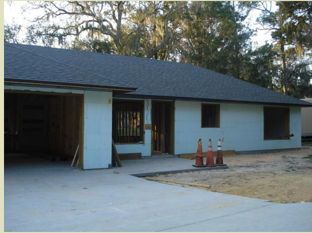
Up with the NEW!!!