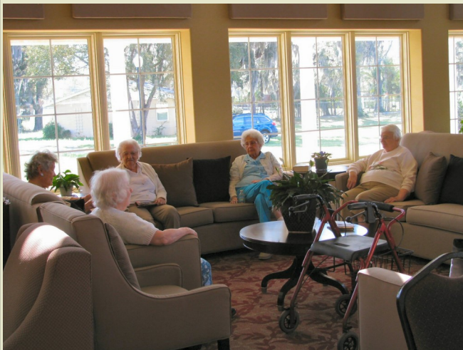
Tuesday Book Club