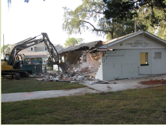
Down with the OLD...