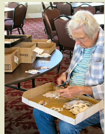
Preparing stamps for a church project