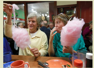
Sower and Volunteers having fun!