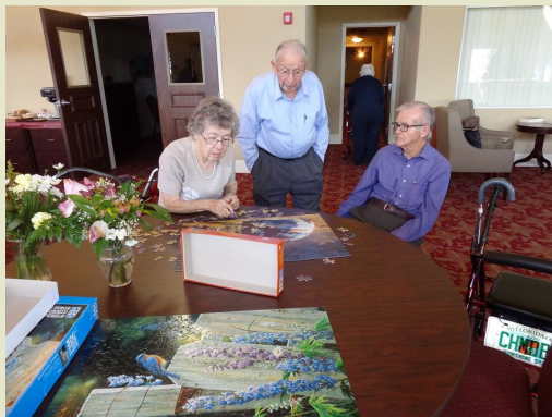
Putting puzzles together

Scott Home is a very busy place. Besides being the dining room and kitchen for the Scott Residents and other guests and special community meals it also offers many other activities such as: