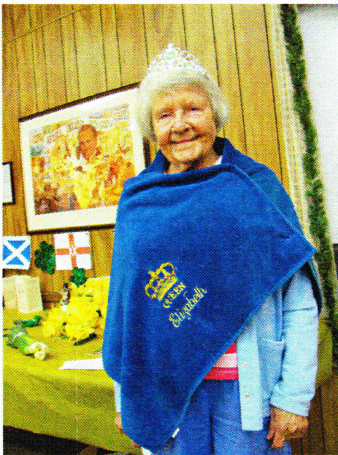
Queen Elizabeth came to visit