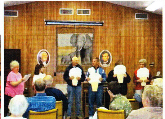
5 Little Ice Cream Cones