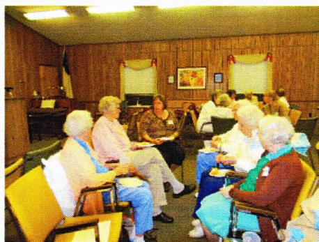
Clermont Baptist ladies who came to visit with the Media Ladies