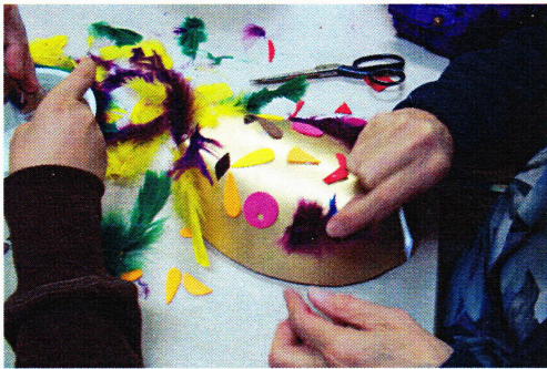
Making a Peruvian Mask