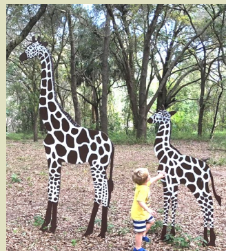
And new wildlife continue to appear in the NFD

We are grateful once again for our Volunteers who help us in so many ways. Washing windows, moving furniture, stripping Spanish Moss from the trees, and much, much more.