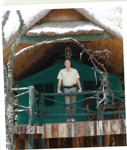
Relax at these distinctive tented camps

After breakfast depart Nairobi to Sweetwaters. The drive passes the small industrial town of Thika surrounded by extensive pineapple and tea plantations. The terrain is on the ascent to the rich farmland of the highlands where one sees coffee growing. You will arrive in time for lunch at the Camp. Enjoy an afternoon game drive at the Ol Pejeta Conservancy and chimpanzee sanctuary. This 70,000 - acre private preserve has views of the peaks of Mount Kenya and offers game drives into countryside many travelers never see. The Ol Pejeta Conservancy and its sumptuous ranch was once the private domain of famed multi-millionaire Adam Kashoggi. This conservancy hosts a variety of African wildlife. Dinner and overnight at Sweetwaters Tented Camp. (B, L, D)