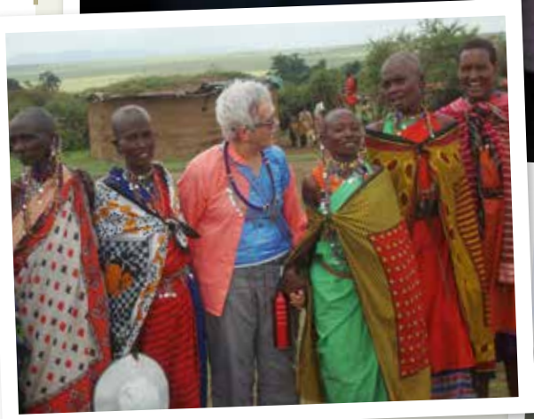
Visiting a traditional Maasai village