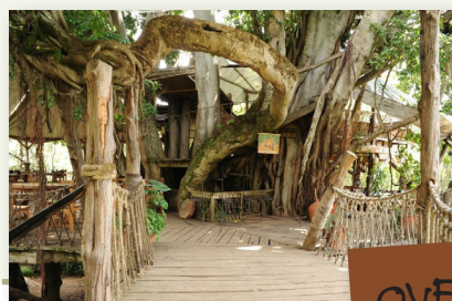
The Trout Tree Restaurant

After breakfast depart for Sentrim Elementaita Lodge situated on the shores of Lake Elementaita. Enroute, picnic boxed lunched as we visit Thompson's Falls which is at an altitude of 7,738 feet. The Falls are named after the Scottish explorer Joseph Thompson who was the first European to discover the falls in 1884. Proceed on to arrive at lodge in the afternoon and enjoy interacting with AIM missionaries prior to the evening dinner. (B, L, D)